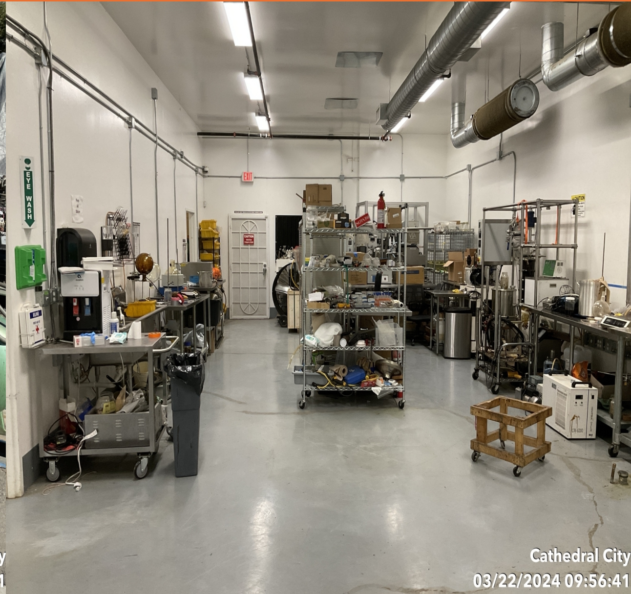
Cathedral City 03/22/2024 09:56:41