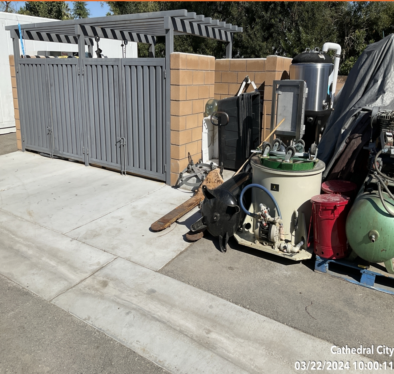
Cathedral City 03/22/2024 10:00:11