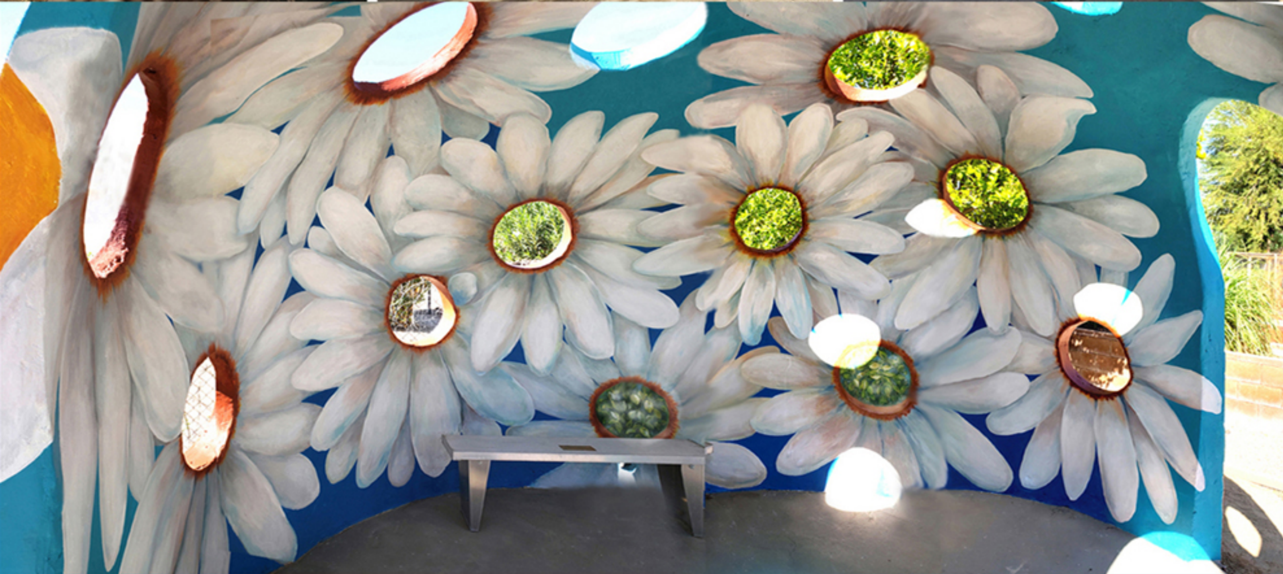
“Happiness” Dome Demuth Park Community Garden