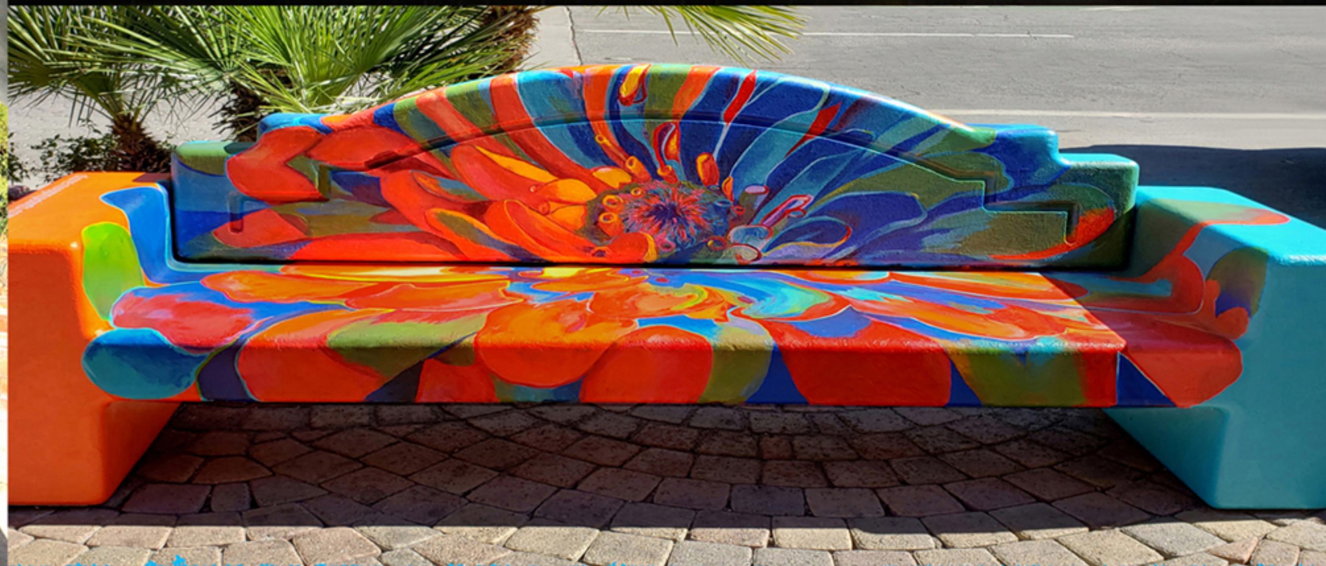
“Save the Bees” bench “Just Glorious” bench