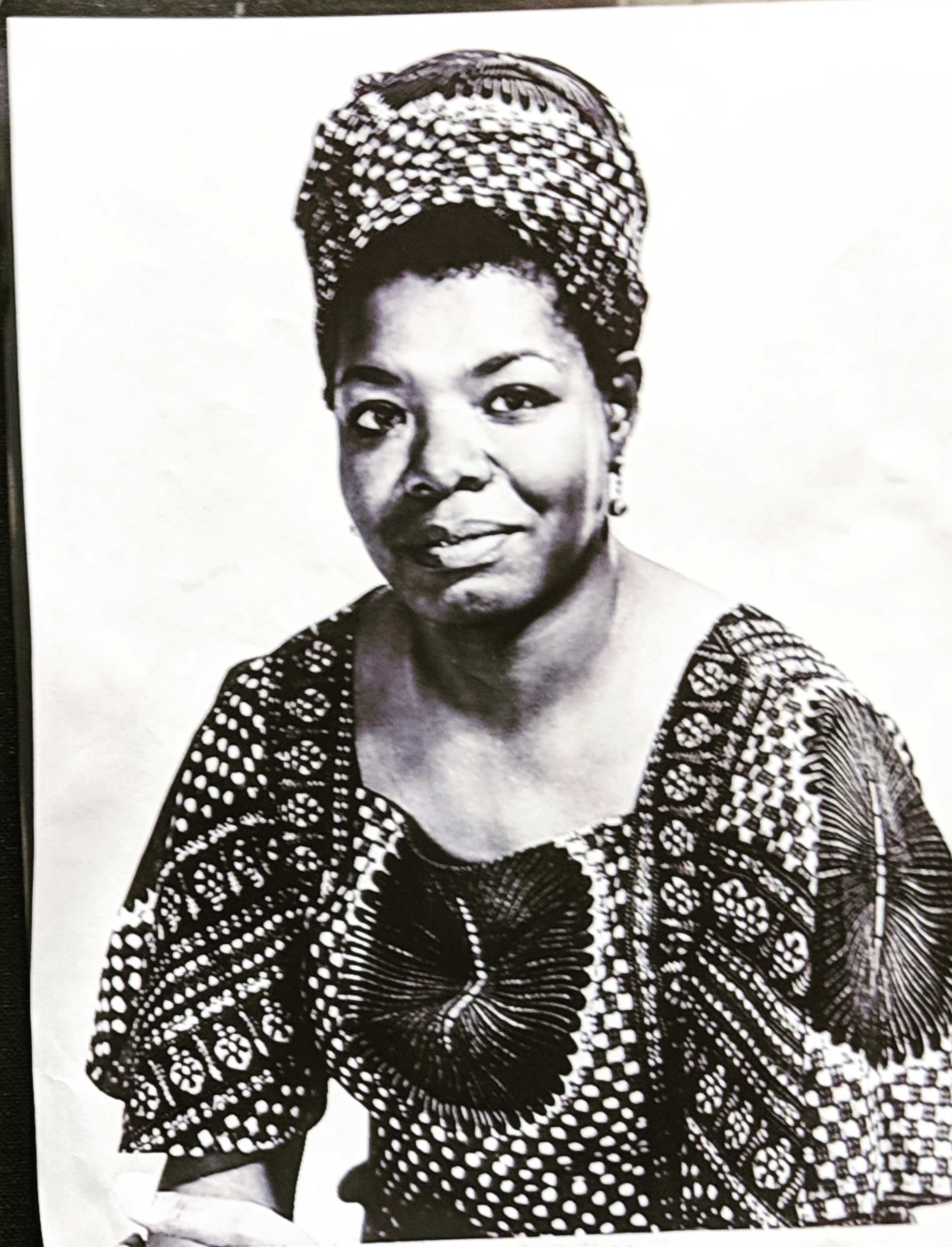
G-7 "It's like jumping into an ice cold pool," says MAYA ANGELOU