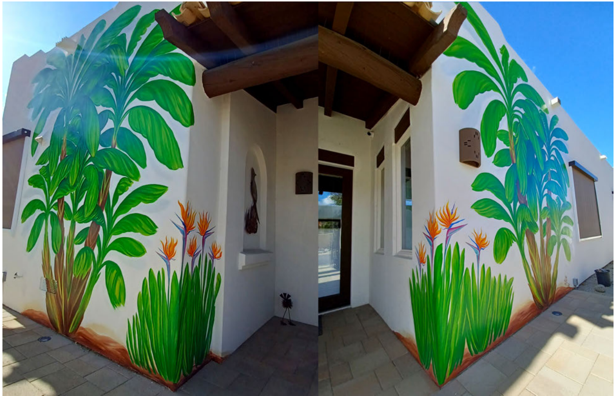
Sample #4 Coachella Air B&B 20ft. wide x 6ft. high