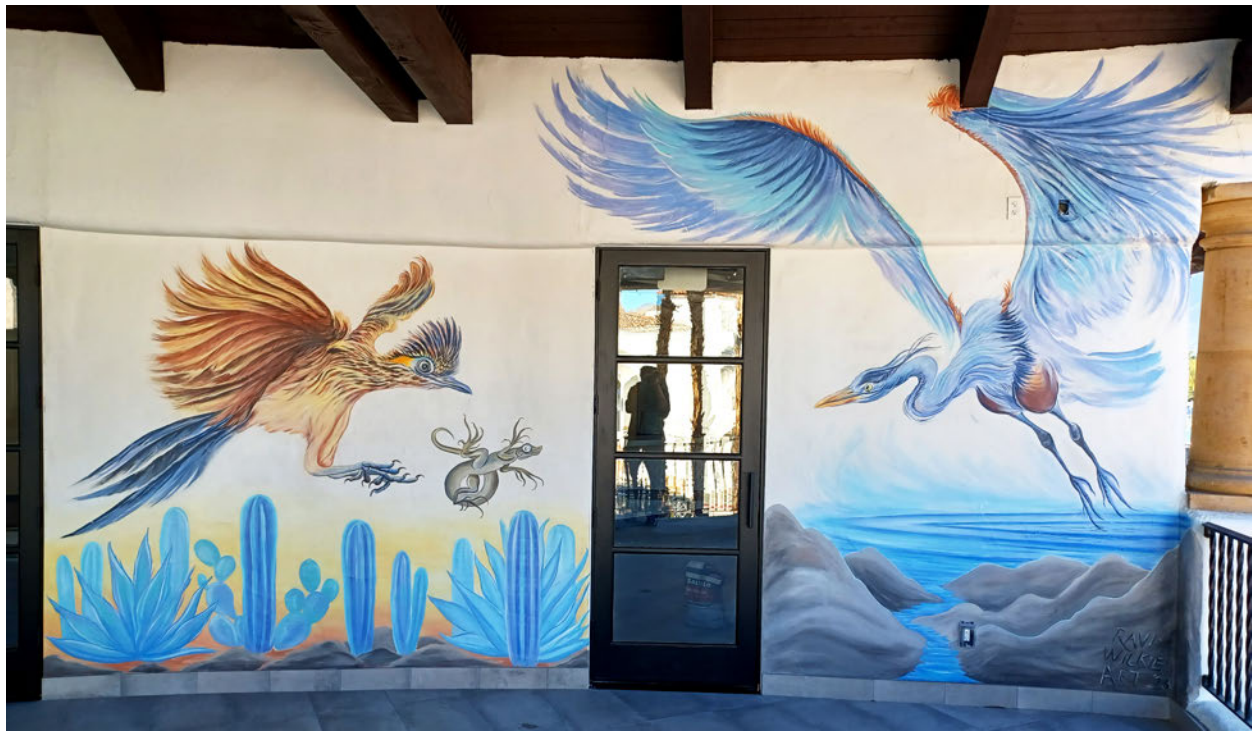
Sample #3 Banana Palms Residential Entry way: 15ft. High Walls