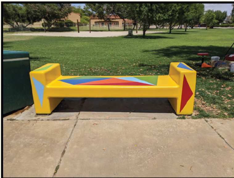
Cathedral City Library-Park Bench Project July 2021