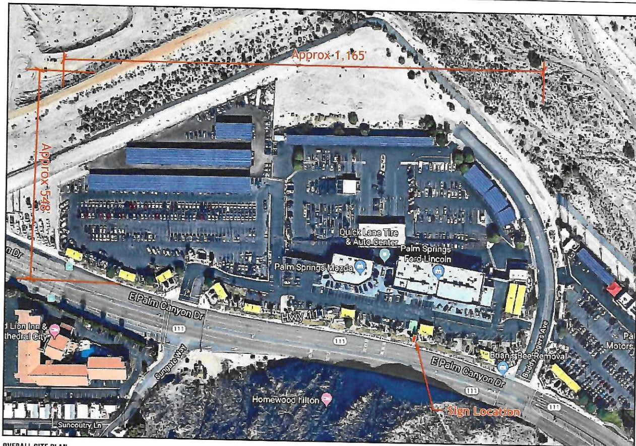
OVERALL SITE PLAN