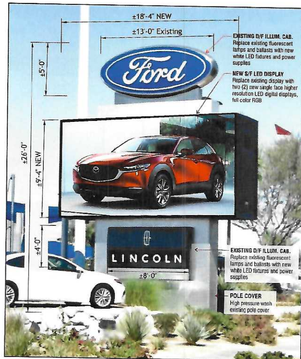
REMODELED SIGN New Higher Resolution Digital LED Display New Lighting for Brand Cabinets

California Region LOS ANGELES 1035 Balboa Avenue Juno Valley, CA 91752 (866) 955-3728