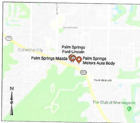
VICINITY MAP Not to Scale

GENERAL NOTES: All work shall comply with: 2022 California Building Code 2022 California Electrical Code 2022 California Energy Code, Title 24 2022 California Existing Building Code 2022 California Fire Code 2022 California Green Building Standards Code 2022 California Mechanical Code 2022 California Referenced Standards Code