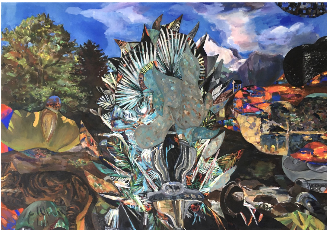
False Idol -2024- Acrylic on canvas 48x68"