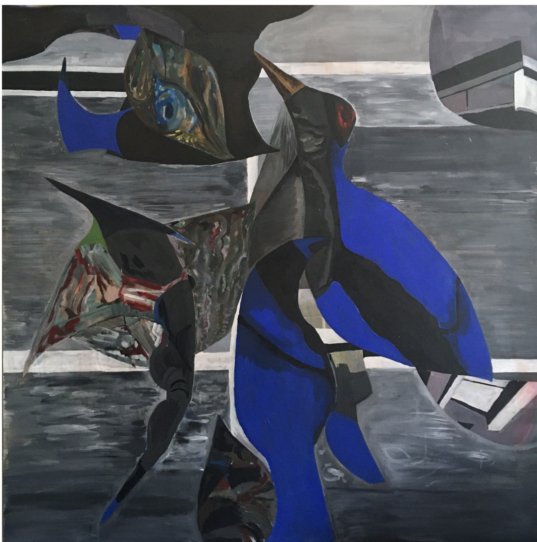
Blue -2022- Acrylic on canvas 62x62"