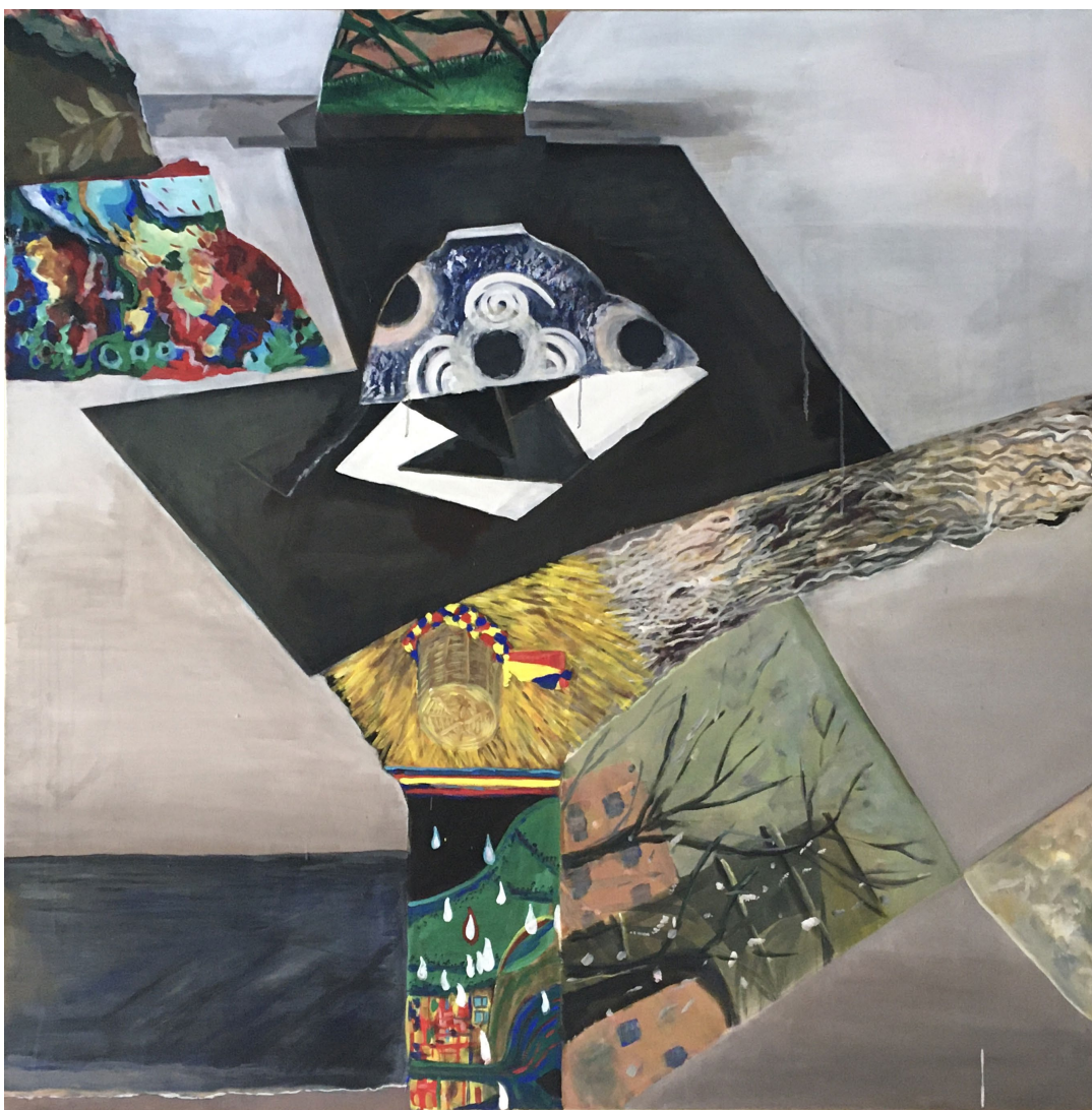
The Song of the Wind -2021- Acrylic on canvas 59x59"