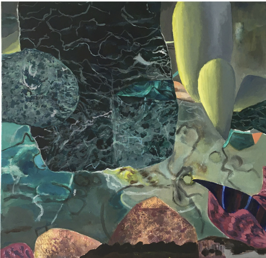
Sleeping Whale -2023- Acrylic on canvas 31x30"