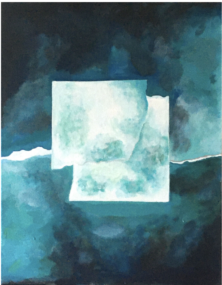
Skies -2024- Acrylic on canvas 22x28"